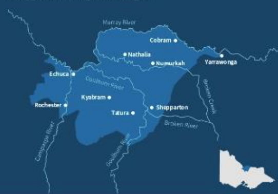
Shepparton Irrigation Region

The Muckatah Surface Water Management Scheme was built between 1997 and 2020 and includes 60km of primary drain and connecting drains to service the catchment. As well as protecting agricultural land, the scheme helps to protect 2295 hectares of remnant vegetation and more than 2000 hectares of wetlands.