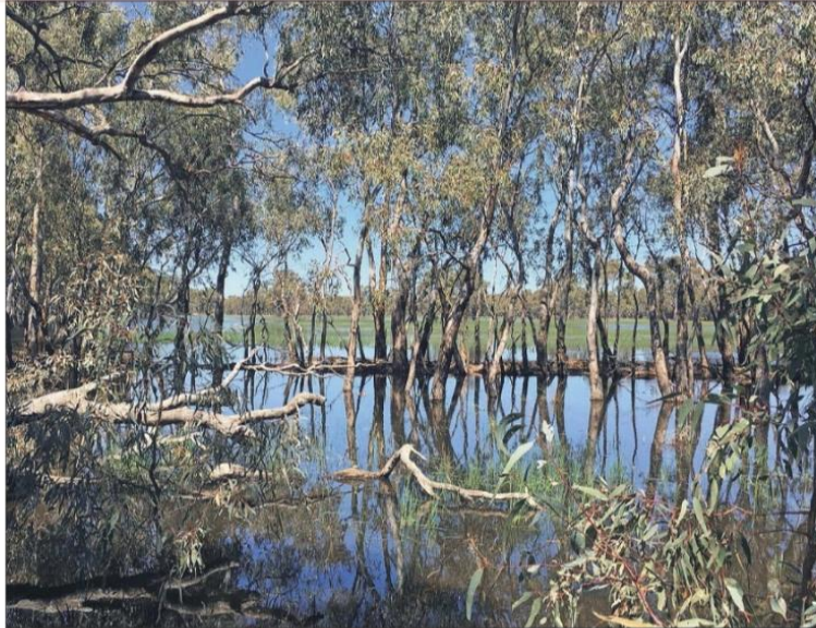
Making a difference: Kinnairds Wetland is fed by flows from the Muckatah surface water management scheme.