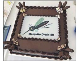
Biting back: Completion of the Mosquito Drain 40 was another significant achievement of the Shepparton Irrigation Region Land and Water Management Plan.

government agency partnerships have been built on trust and an understanding of how to be good partners, often forged in trying circumstances."